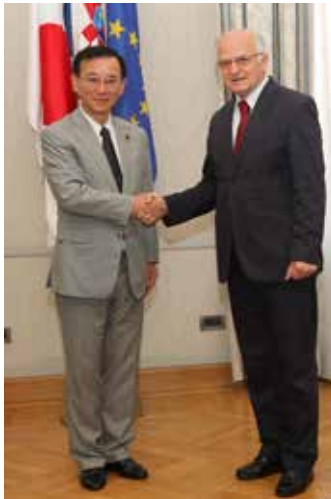
H.E. MR. SADAKAZU TANIGAKI, MINISTER OF JUSTICE, AND PARLIAMENT SPEAKER H.E. MR. JOSIP LEKO, 2014