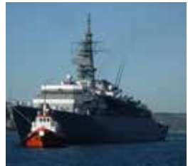
VISIT OF JAPAN MARITIME SELF-DEFENCE FORCES TRAINING SHIP KASHIMA, 2013