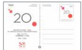
POSTAL CARD ISSUED BY CROATIAN POST TO COMMEMORATE 20TH ANNIVERSARY OF DIPLOMATIC RELATIONS BETWEEN JAPAN AND CROATIA

If you would like to know more... Please visit our website and feel free to contact us for more information!