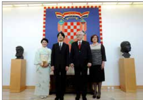
VISIT OF T.I.H. PRINCE AND PRINCESS AKISHINO, COMMEMORATING THE 20TH ANNIVERSARY OF DIPLOMATIC RELATIONS, 2013