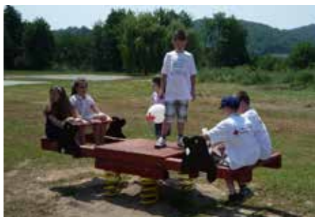
PLAYGROUND IN BRESTOVAC WAS BUILT THROUGH GGHSP PROGRAMMES

Projects for acquisition of educational equipment were aimed at helping children in everyday learning and making teaching processes easier and more interesting. Projects included 5 kindergartens, 23 primary schools and 2 youth centres. Grants were given to seven projects for vocational training activities, too.