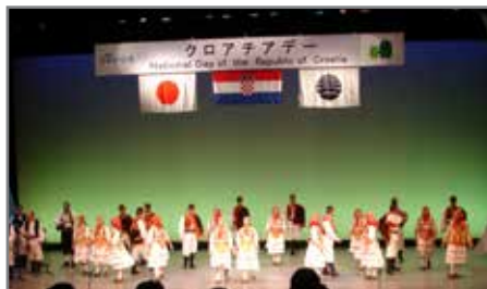
LADO ENSEMBLE PERFORMANCE IN JAPAN