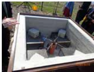
LANDSLIDES MONITORING STATION AT KOSTANJEK, DONATION THROUGH JICA PROGRAMME