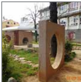
JAPANESE GARDEN IN RIJEKA