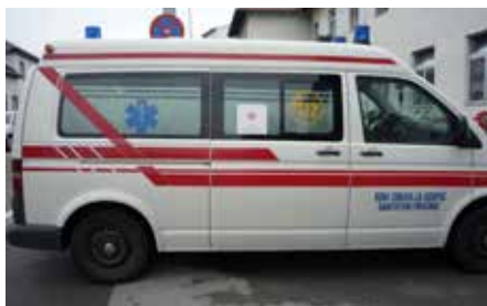
AMBULANCE VEHICLE DONATED THROUGH GGHSP PROGRAMME

The Government of Japan supported demining in Croatia with 1.8 million EUR through the GGHSP program. As Croatia has developed advanced demining technologies in the world, Japan Science and Technology Agency (JST) and Croatian Mine Action Centre (CROMAC) have, unrelated to GGHPs projects, developed a joint project named ALIS to develop new mine detection systems in Croatia.