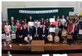
JAPANESE LANGUAGE SPEECH CONTEST

and institutes from both countries participated in this project. The project was successfully completed in 2014. This represents a new type of cooperation between Japan and Croatia, and its results are expected to be put into practical use in the neighbouring countries as well.