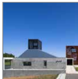
LANTERN - HOUSE OF CROATIA-JAPAN FRIENDSHIP IN TOKAMACHI CITY