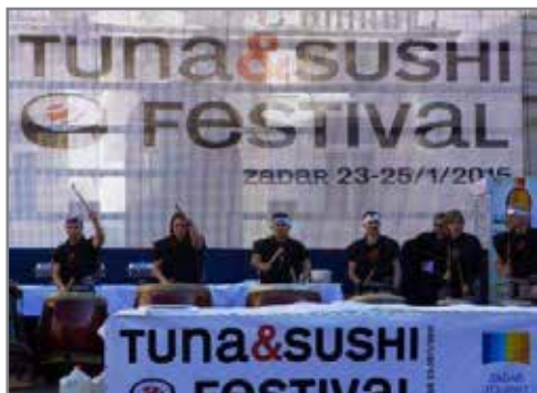
TUNA&SUSHI FESTIVAL IN ZADAR

(source: Croatian National Tourist Board (2014), Croatian Bureau of Statistics (2003)). On the other hand, number of visitors from Croatia to Japan remains under 2 000 (Source: Japan National Tourist Organization). Japanese companies in the fields of automobiles, motorcycles, electric appliances, tobacco, medical equipment, have set up their representative offices in Croatia. Yazaki Europe established their R&D center in Zagreb. During the summer months, Japan Airlines has been operating charter flights to Zagreb and Dubrovnik since 2007.