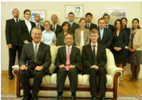
MEMBERS OF THE EMBASSY OF JAPAN

If you would like to know more... Please visit our website and feel free to contact us for more information!