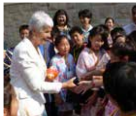
CHILDREN FROM SENDAI CITY, INVITED BY THE GOVERNMENT OF CROATIA, ENJOYED THEIR STAY IN SPLIT, 2011

The Government of Japan and the people of Japan will never forget this action of sincere sympathy. Japan believes our ties can and will be much stronger in the future. With this in mind, Japan hopes that our cooperation can be expanded in various fields and international arenas during the following years of our diplomatic relations.