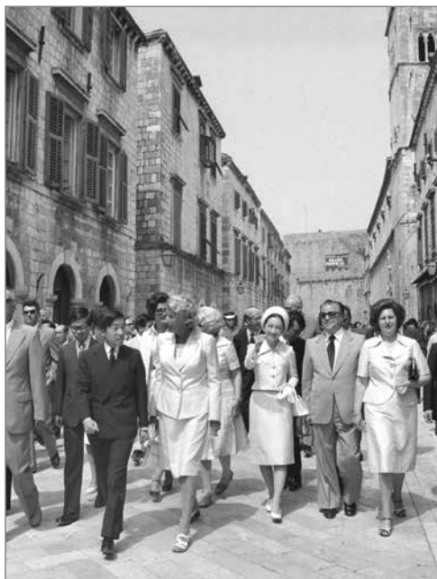
T.I.H. CROWN PRINCE AKIHITO AND PRINCESS MICHIKO IN DUBROVNIK IN 1976