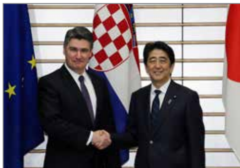
H.E. MR. ZORAN MILANOVIĆ AND H.E. MR. SHINZO ABE, 2015

After the declaration of independence by the Croatian Parliament in 1991, the Government of Japan recognized the Republic of Croatia as an independent state on March 17, 1992, on the occasion of the Croatian Minister of Foreign Affairs Zvonimir Šeparović's visit to Japan. The two countries established diplomatic relations on March 5, 1993. Croatia opened its embassy in Tokyo on September 5, 1993, and Japan opened its embassy in Zagreb on February 8, 1998.